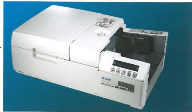
SR-3500 / SR-6000 (Main body)

And OMR technology is more accurate than Optical Scanner due to recognizing ONLY density of mark sense (not need recognize any character from Image).