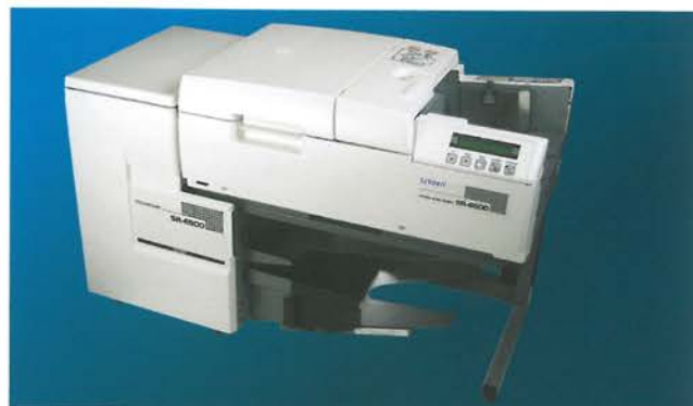
SR-6500 (Main body + Select Stacker)

Or others, you can feel free to select operating software made for our OMR's.